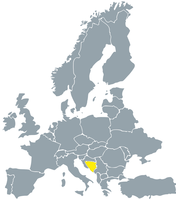
Position of Bosnia and Herzegovina (BiH) in the region

Žepče Municipality is located in Central Bosnia, in Zenica-Doboj Canton, on the most important route linking Eastern Europe and the Adriatic (E73 or M17: Bos. Šamac-Sarajevo-Mostar).