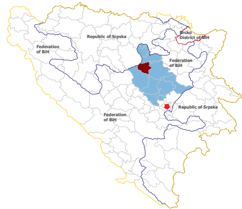
Position of Žepče Municipality in BiH and Zenica-Doboj Canton